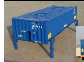
ISO Half Height Oil Transporter