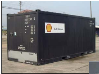
Bitutainers for Asphalt & Bitumen Carriage