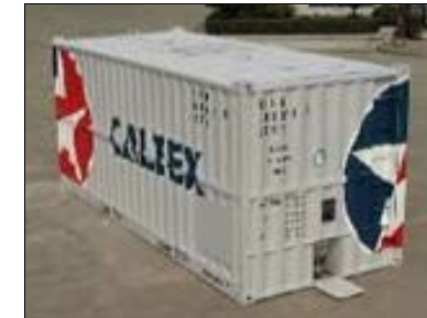
Patented Lubetainer. Crude, Grade and Waste Oil carrier